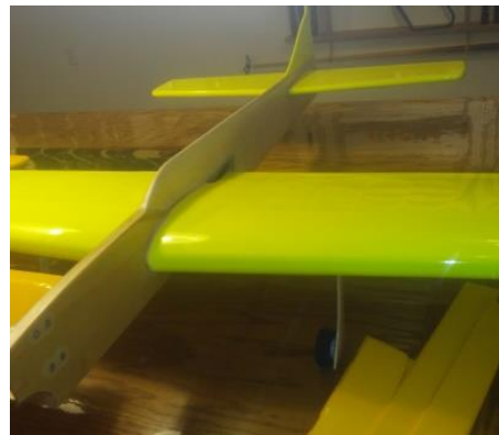
6. Shark 60 (profile) – looks like a new build