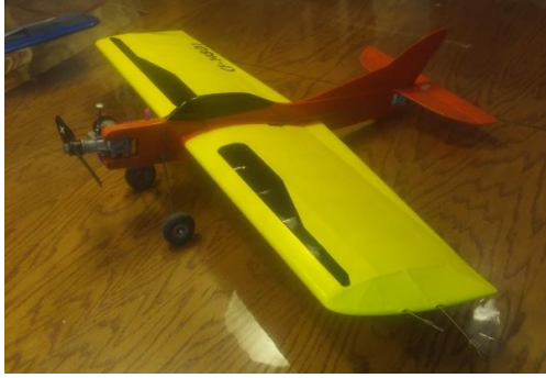
3. Flight Streak - repair job