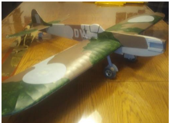
7. Spitfire (profile) – scratch-built for a .46