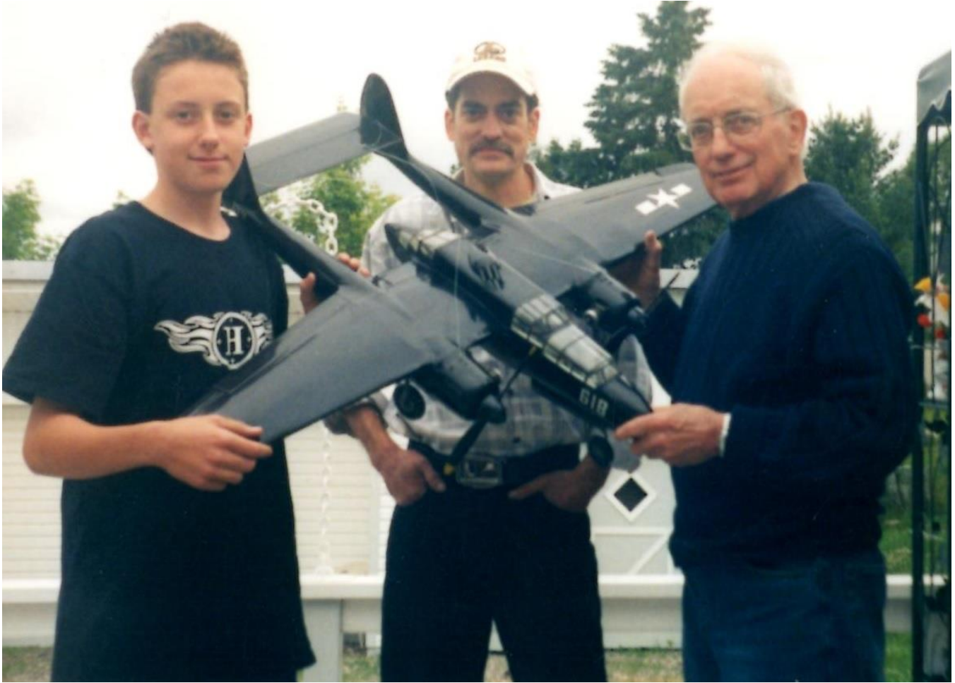
Three generations of Irelands, father's day 2005.