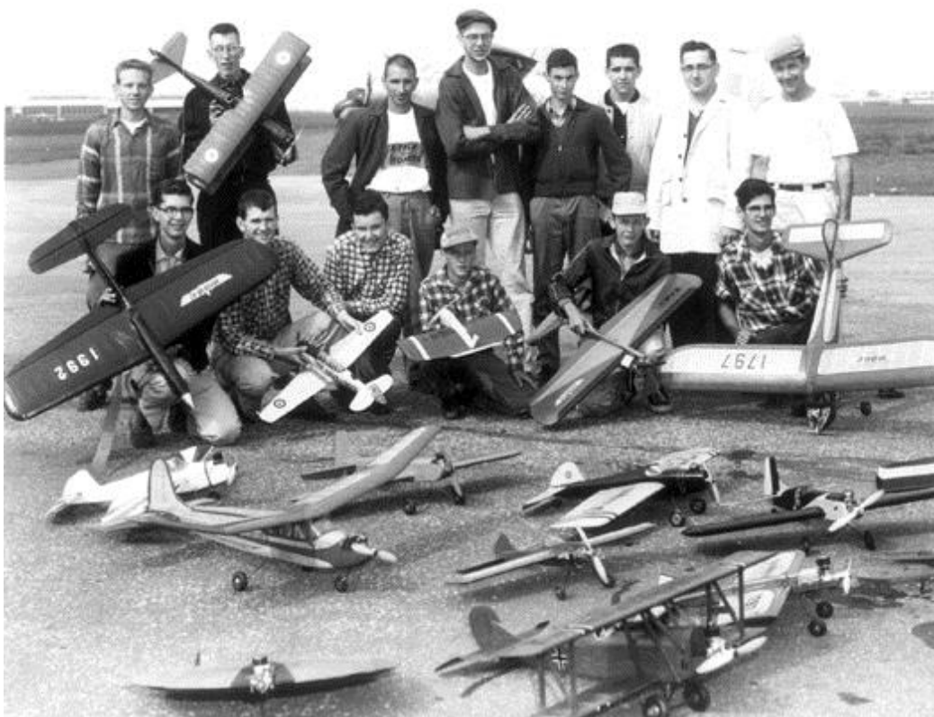
Balsa Beavers Model Flying Club - Circa 1960