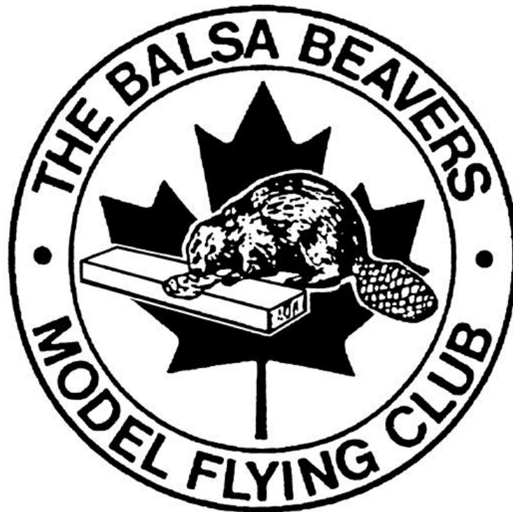
Balsa Beavers Logo Crest - Circa 1970?