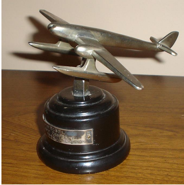
1942 Eaton model aircraft contest trophy